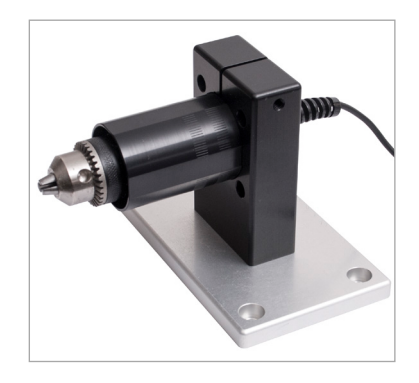
AC1007 Tabletop stand for sensor

Secures the sensor in a horizontal orientation.