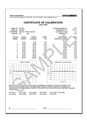
CERT Calibration certificate with data Includes 10 data points in each measurement direction (short form certificate without data is included).

Secures the sensor in a horizontal orientation.