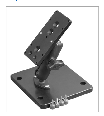
AC1100 Tabletop stand for indicator Conveniently positions the indicator for easy viewing. Includes thumb screws to for indicator installation and thru holes for bench mounting.