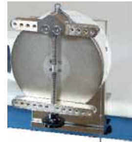
AC1036 Calibration kit Complete set of brackets, cable, AC1036 and hardware for calibration of any Series TT01 torque tester. Weights not available from Mark-10.