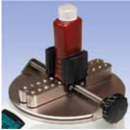
CT001 Flat jaws Set of rubber jaws for gripping square or odd shaped containers.