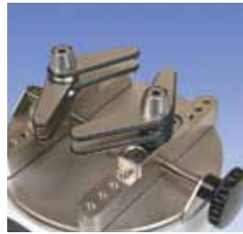
CT003 Adjustable jaws Rubber-edged arms may be independently repositioned to accommodate unique samples.