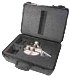
CT002 Carrying case Provides storage space for the TT01 tester, gripping jaws, AC adapter, and accessories.