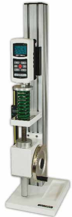
Shown with a TSF test stand in a spring testing application

The M5-1000's averaging mode addresses the need to record the average force over time, useful in applications such as peel testing, while external trigger mode makes switch activation testing simple and accurate. An ergonomic, reversible aluminum design allows for hand held use or test stand mounting for more sophisticated testing requirements. The M5-1000 force gauge is directly compatible with high capacity Mark-10 test stands, grips, and software.