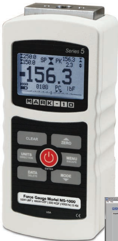
MESUR™ Lite data acquisition software is included with the gauges