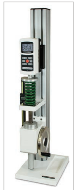
Shown with a TSF test stand in a spring testing application

The gauge include MESUR™ Lite data acquisition software. MESUR™ Lite tabulates continuous or single point data. Data saved in the gauge's memory can also be downloaded in bulk. One-click export to Excel easily allows for further data manipulation.